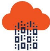
AWS & Cloud Services