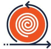
Product Lifecycle Strategy

Having principle developers and project managers from Apple, Microsoft, and Adobe that have lived in the startup ecosystem for over a decade, Modern Logic gives you access to resources that allows you to build scalable solutions that fit your budget.